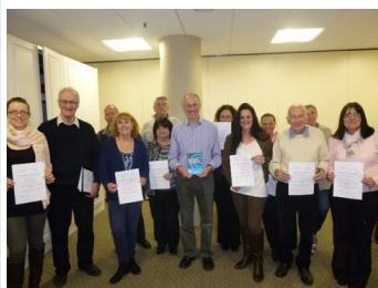
Attendees at Belarmine Community Facility receive their attendance certificates

Our Community Facilities Governance Programme was run on behalf of Dun Laoghaire Rathdown County Council. A total of 40 participants attended a series of evening workshops which included development of a board handbook for Community Facilities.